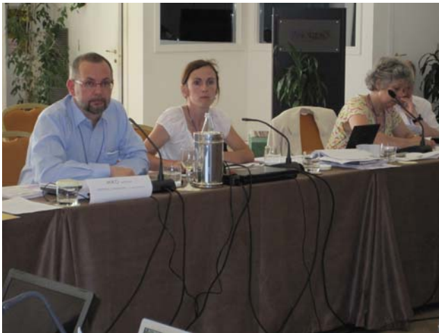
The Commission and the ETC-BD at Brindisi

At the Continental Biogeographical seminar held in Darova (Czech Republic) in 2006 it was clear that the Polish proposals for Natura 2000 were very incomplete. Following new proposals from Poland a bilateral meeting was held in Warsaw in March and it is clear that Poland has made significant progress.